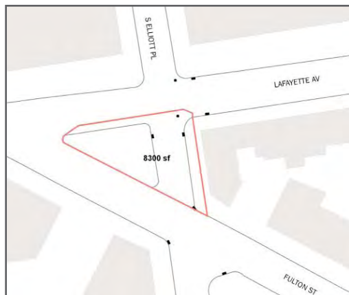
Map courtesy of Fulton Area Businesses (FAB).

All are welcome to attend, homeowners & renters alike.